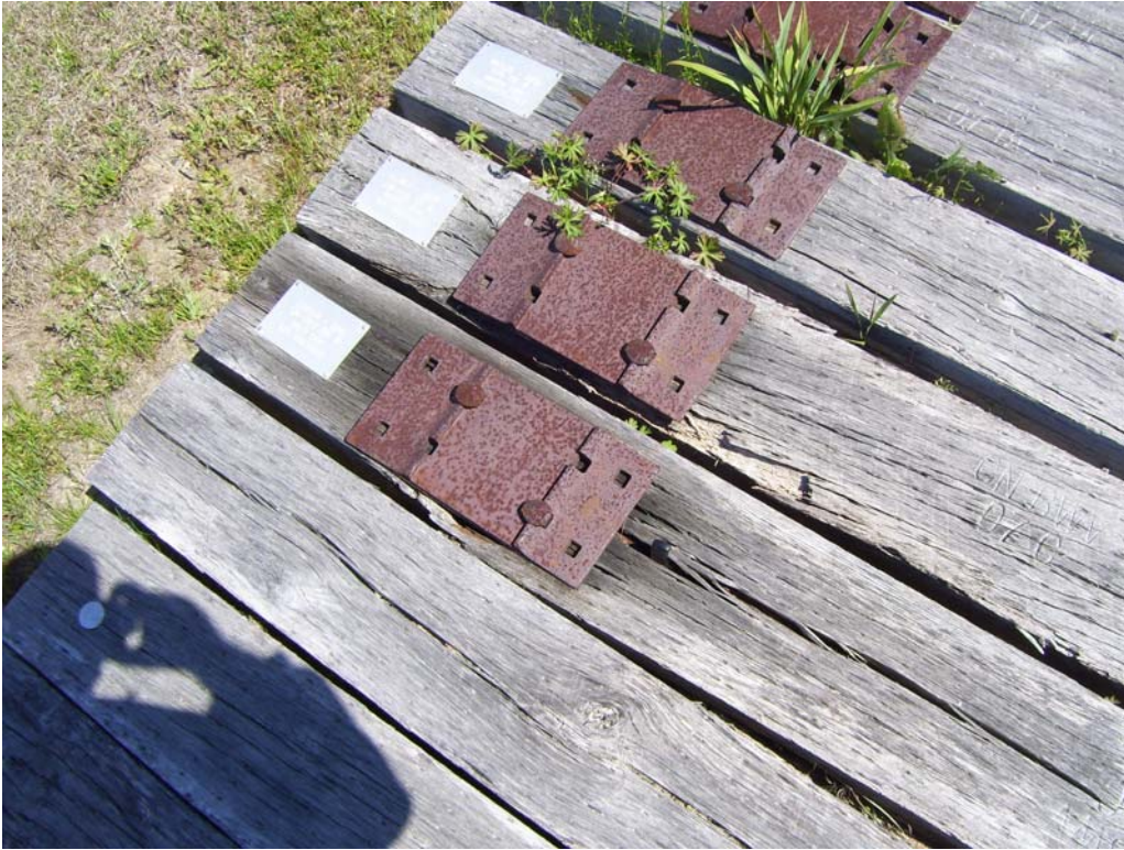
Figure 7 - Tie with “iron sickness” and decay.