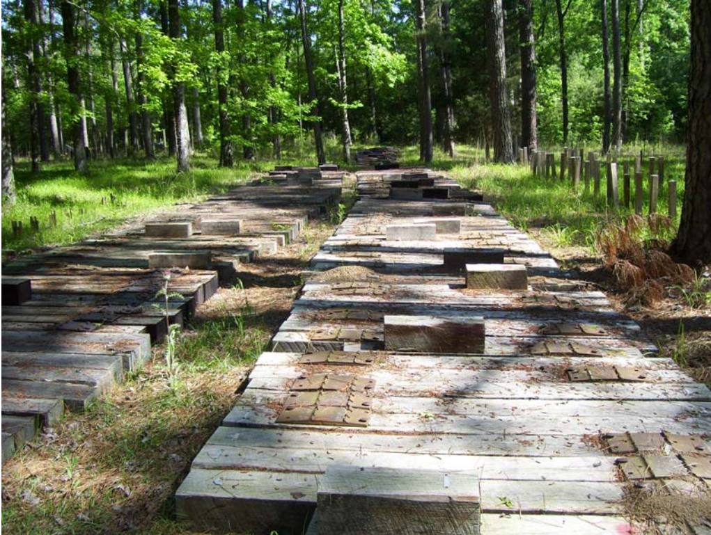
Figure 2 - A general photograph demonstrating the exposure conditions at Site 1 at the time of inspection.