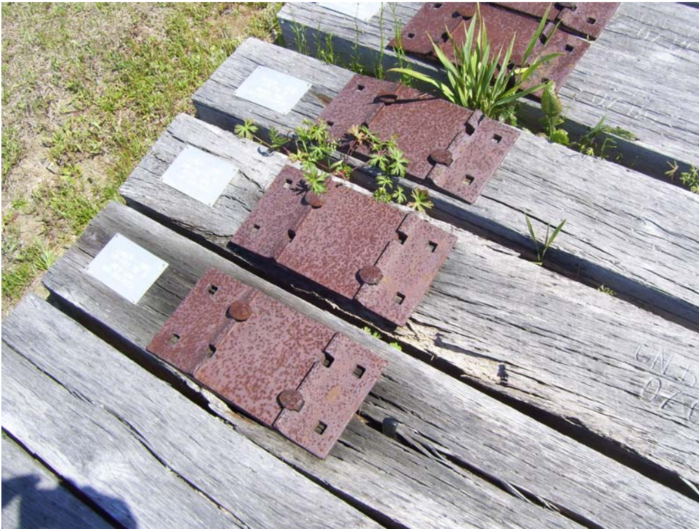
Figure 9 - tie with severe checking.