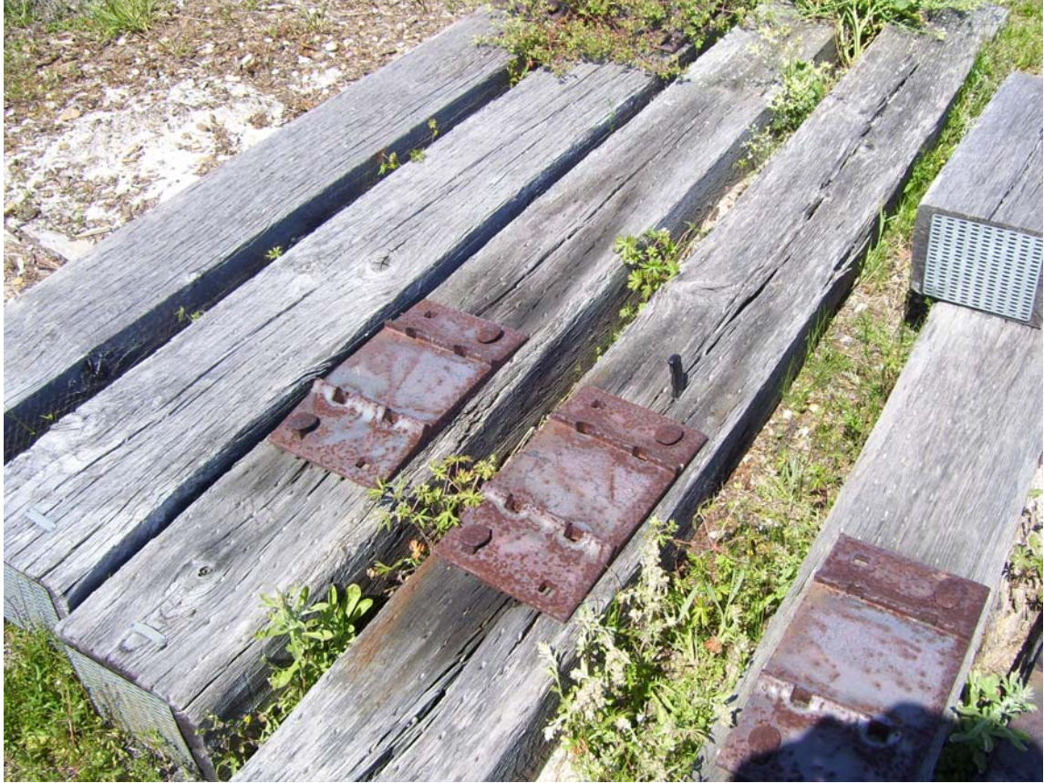
Figure 81 – tie with “iron sickness” and checking.