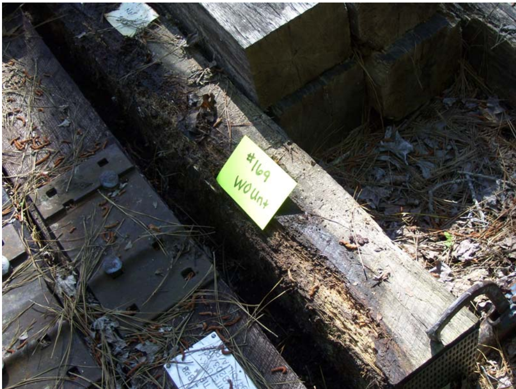
Figure 5 - Tie #169 (white oak/untreated) showing signs of obvious decay.