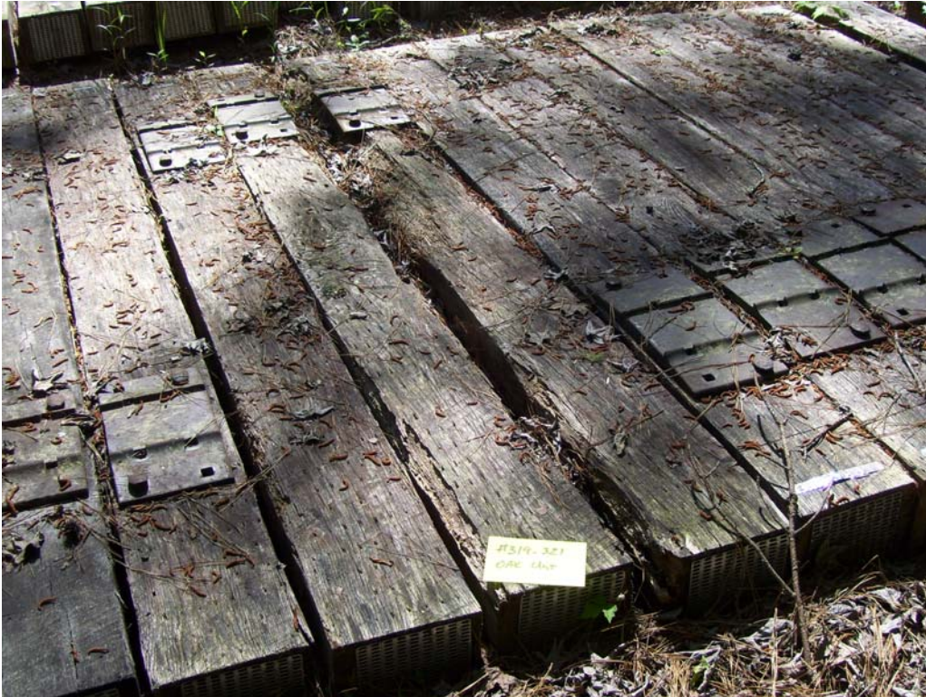
Figure 6 - Ties #319-321 with noticeable decay.