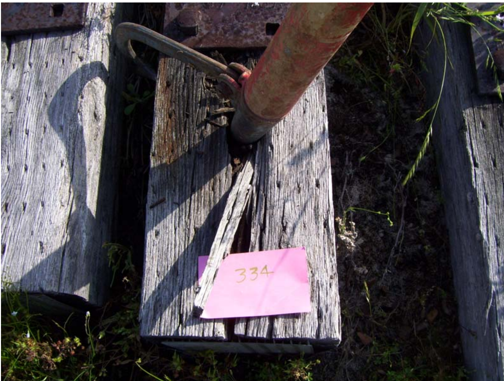
Figure 70 - #334 showing extensive decay.