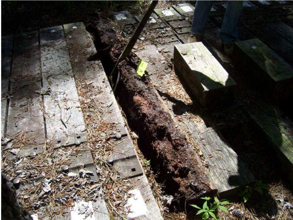
Figure 4 - Tie #115 (untreated red oak) with signs of extreme decay and termite activity.