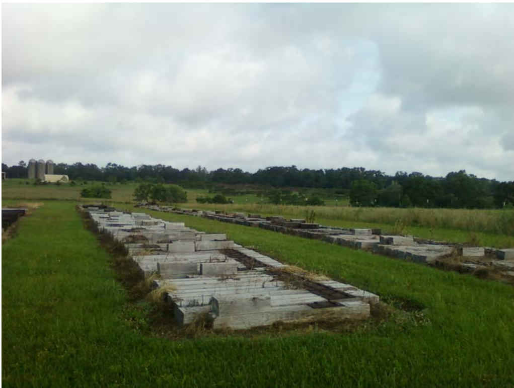
Figure 1 - An overall view of exposure Site 2 illustrating the conditions at the time of inspection.

General photographs documenting the condition of the sites and some of the noted deterioration can be seen below (Figures 1 - 11). The tie number denotes the position of exposure as recorded on the plot-maps. Copies of the inspection forms can be found in the appendix.