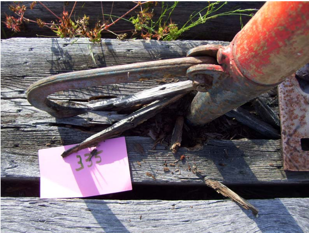
Figure 8 - Tie #335 with extensive decay.